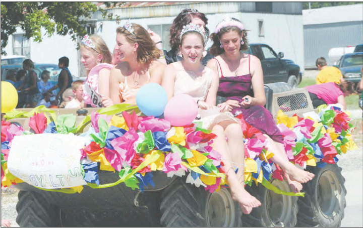
PROMINENT in Saturday's Rockville Festival was this entry featuring Festival queen candidates.