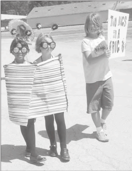
Second place, children’s division, Two Bugs in a Rug