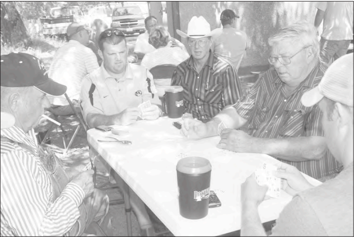
The pitch tournament is always a big attraction.