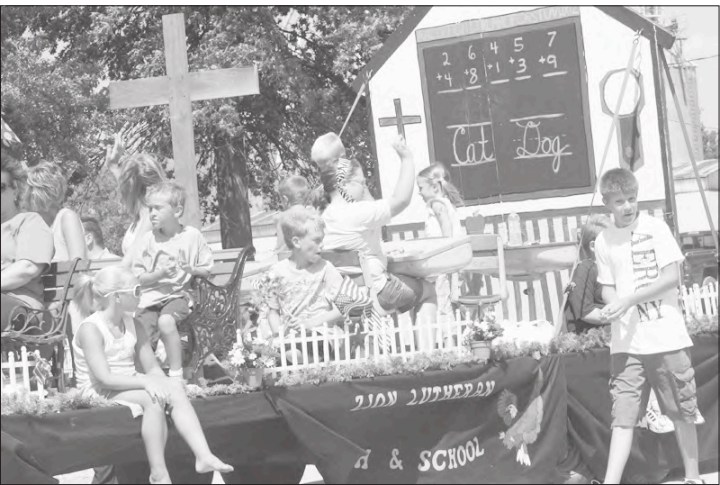
First place float, adult division, Zion Lutheran Church, Prairie City.